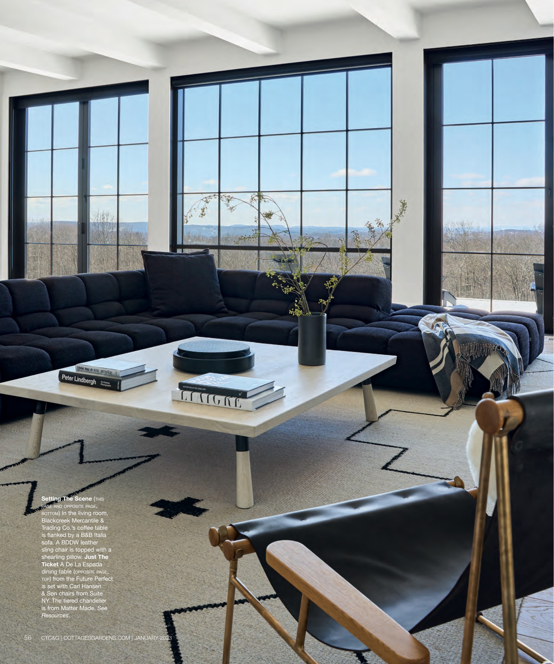
Setting The Scene (THIS PAGE AND OPPOSITE PAGE, BOTTOM) In the living room, Blackcreek Mercantile & Trading Co.'s coffee table is flanked by a B&B Italia sofa. A BDDW leather sling chair is topped with a shearling pillow. Just The Ticket A De La Espada dining table (OPPOSITE PAGE, TOP) from the Future Perfect is set with Carl Hansen & Son chairs from Suite NY. The tiered chandelier is from Matter Made. See Resources .